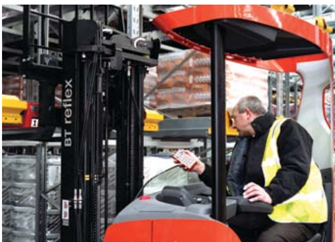
The remote control allows the operation of several shuttle units simultaneously

Durability is assured with robust build quality and the benefit of liquid sealing to protect against spillages.