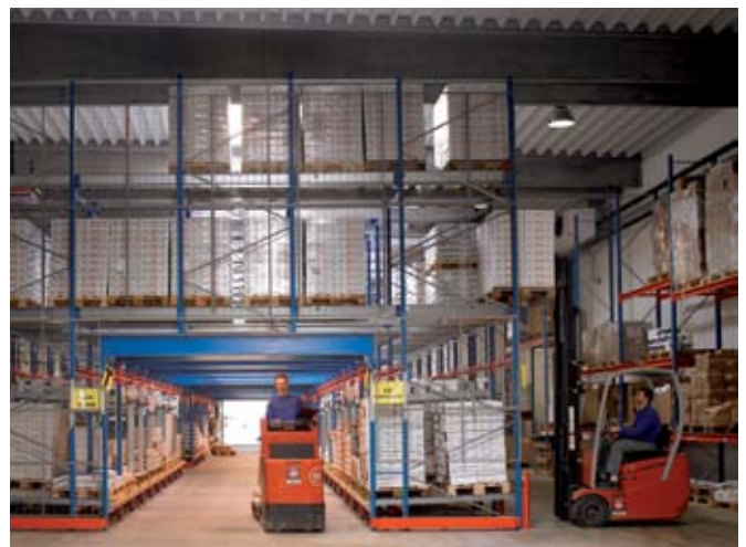
Order picking tunnel with buffer storage on top.