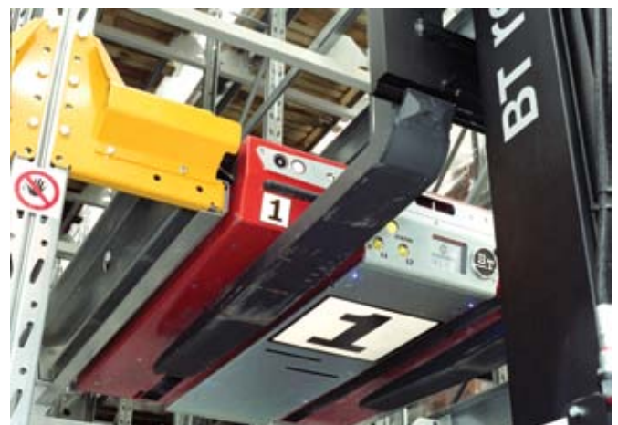
Fork guides ensure safe, accurate transfer of shuttle units using conventional forklifts