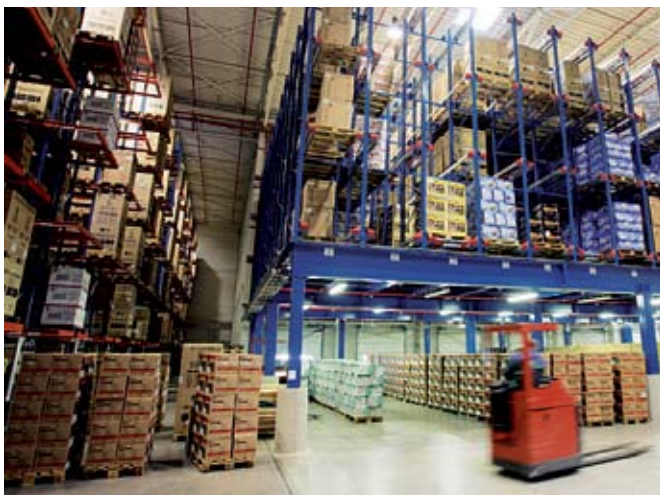
BT Radioshuttle on a raised platform above dispatch area

The BT Radioshuttle is also available as a combi where it is possible to handle two different dimensions of pallets, for example, pallet measurements 800mm x 1200mm and 1000mm x 1200mm. The machine automatically identifies, which size pallet is to be collected or dropped off.