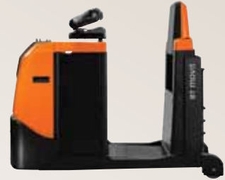
S-series – TSE300