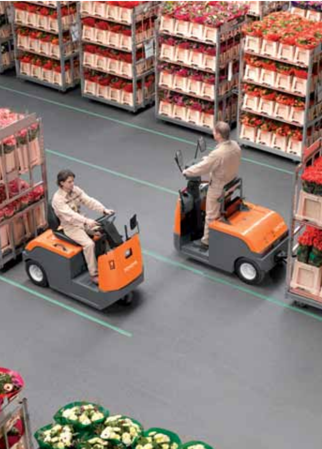
4CBT2 (left), 4CBTY2 (right)