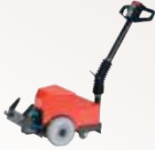
W-series – TWE100