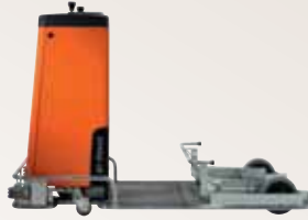
N-series – TSE100 / TSE100W