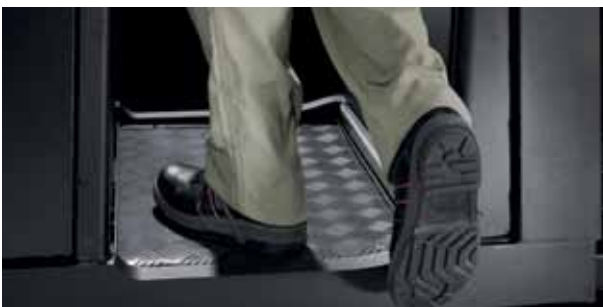
The TSE300's low step-in height reduces the strain of repeatedly stepping into and out of the truck. The floor is suspended to reduce vibration, enhancing driver comfort

One of the major wearing parts on most tow tractors is the drive-wheel, due to the stress of repeated starting and stopping. The smooth, controlled operation of the electronic braking system on BT Movit S-series trucks significantly reduces drive-wheel wear.