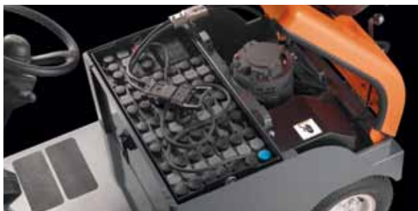
Toyota Tracto R-series electric models feature a 48V electrical system with AC motors, for responsive, energy efficient power delivery and simple maintenance

Toyota Tracto R-series engine-powered trucks meet the most demanding requirements – higher speeds, heavier loads, frequent outside work, and travel on steeper and longer gradients. Outstanding power and manoeuvrability are combined with a high level of operator comfort. Toyota expertise has been fully utilised to produce an ergonomic driver compartment designed to minimise operator fatigue over longer periods of work activity.