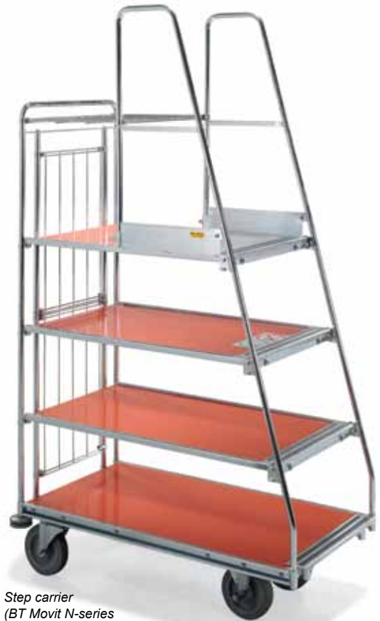
Step carrier (BT Movit N-series TSE100W only)