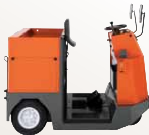
S-series – CBTY4