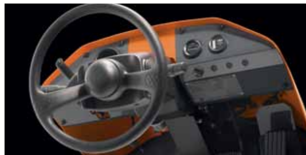
R-series models' car-like control configurations, with levers positioned at the operator's fingertips, make them easy to operate for long periods

Toyota durability is built-in to every part of these models, including the Toyota-designed and built engines and transmissions. These achieve low exhaust emissions compliant with latest diesel emissions regulations.