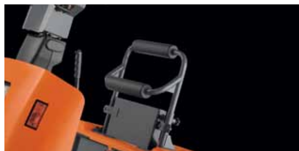
The backrest is height-adjustable to accommodate different operators in comfort

Easy servicing ensures downtime and cost are kept to a minimum.