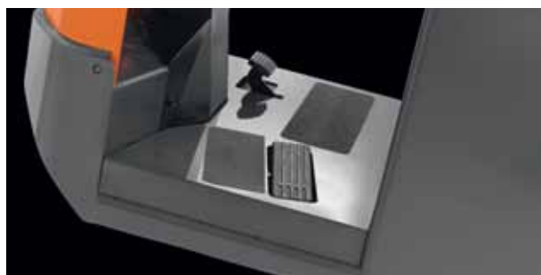
S-series' low step-in height makes getting on and off easy. The Operator Presence System (left-hand pedal) ensures that the tractor cannot be driven unless the operator is standing in the correct position

The 48V electric system with AC motors ensures ample power, delivered efficiently, yet with simple maintenance requirements.