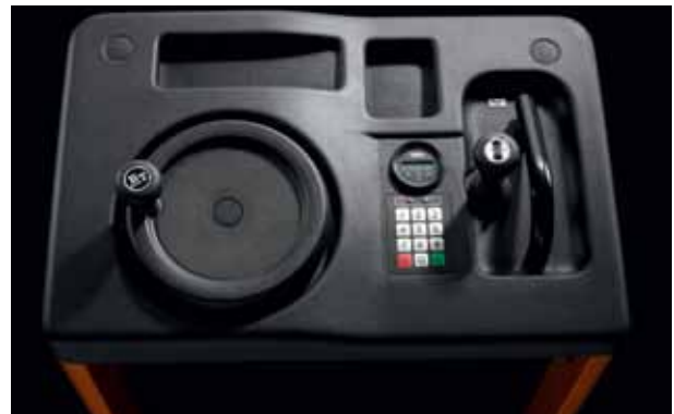
PIN-code access ensures that the trucks are only driven by qualified personnel

Service accessibility is excellent and the electronic fault finding function, along with the maintenance-free AC drive motor, ensures the N-series keeps working.