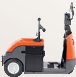
S-series – 4CBTY2 / 4CBTYk4