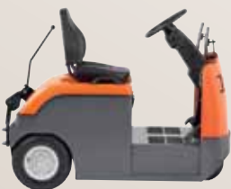
R-series – 4CBT2 / 4CBT3 / 4CBTk4