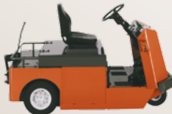
R-series – CBT4 / CBT6