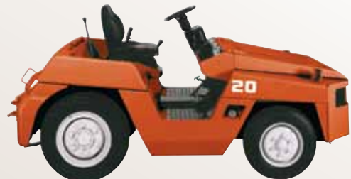
R-series – 2TG20 / 2TG25 / 2TD20 / 2TD25