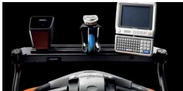
The BT Movit S-series E-bar option allows the mounting and powering of ancillary equipment such as computers and barcode scanners