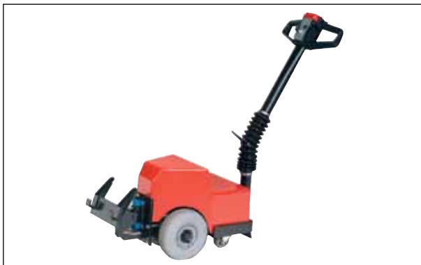
BT Movit W-series TWE100 – 1.0 tonne towing capacity With the TWE100, roll cages weighing up to 1000kg can be transported with minimal effort, even on rough or uneven floors. By reducing the amount of manual effort involved in moving roll cages the TWE100 increases productivity and reduces the risk of strain or injury.

With simple and efficient AC-power, N-series is ideal for picking and transporting goods between production facilities and warehouses, particularly in just-in-time operations. Productivity gains of up to 50% compared to manual picking are possible,