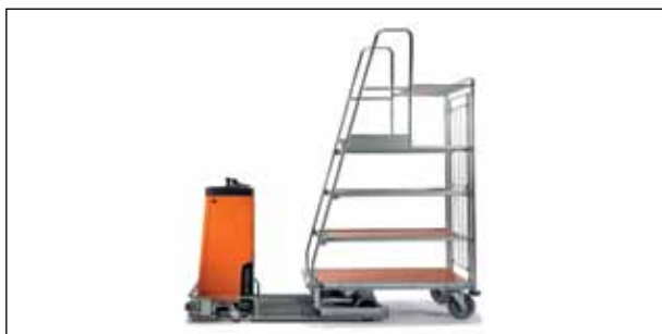
A BT Movit N-series truck docked with a step carrier

Toyota Material Handling is also able to work with customers to design and build bespoke load carriers to suit the precise requirements of their applications.