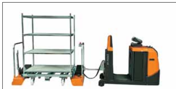
A BT Movit TSE300 towing host carrier, loaded with a separate shelf carrier